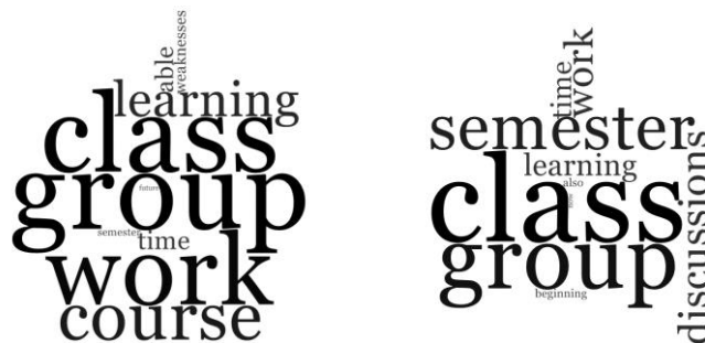
Figure 3. Word clouds created on the basis of the word count analysis for the two cohorts separately (left panel: first cohort; right panel: second). The 10 most frequent words are illustrated with the more prominent ones being the most frequent.

The ten most reported words are illustrated separately for each cohort in Figure 3. The most frequent words used were generally consistent across the two cohorts.