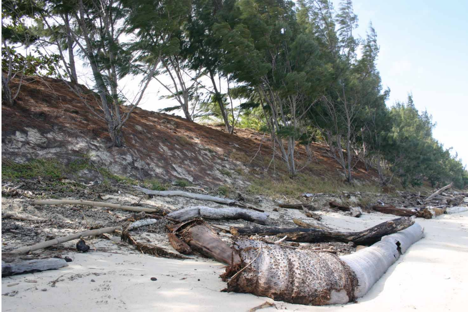
Figure 2. Revegetation and sand dune stabilisation work on Poruma.

Responding to cultural erosion from climate change is not listed in the regional climate change strategy as a priority issue (TSRA 2010), which indicates that the top-down approach to climate change has not primarily been informed by Islander priorities. Torres Strait Islanders are not alone in this concern, as cultural erosion has also been raised as a priority issue in mainland Aboriginal communities. In Kakadu National Park, for example, this is reflected in policy documents that explicitly state “cultural expression would appear to be directly threatened by climate change” (Director of National Parks 2010, p. 5).