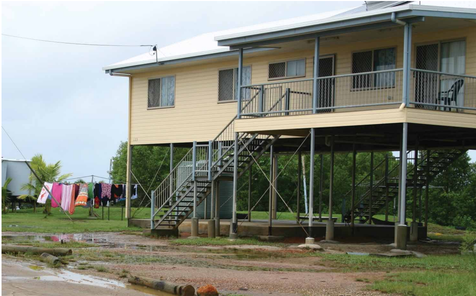
Figure 4. New raised house on Saibai.