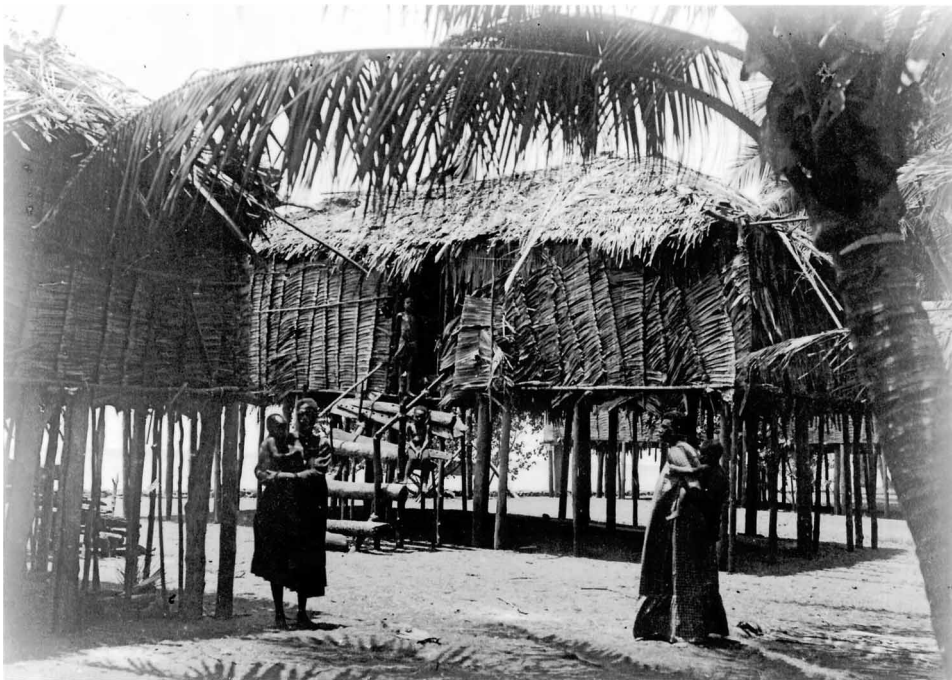
Figure 3. Traditional house on Saibai.

Minister Wong did announce financial support during her visit, including $1 million to install tide gauges to monitor sea level rise, along with $400,000 to support additional scientific research into climate impacts (Wong et al. 2010). The promise of monitoring an already documented problem and continuing to do more scientific research was met with resistance in some Torres Strait communities. Community leaders from the central