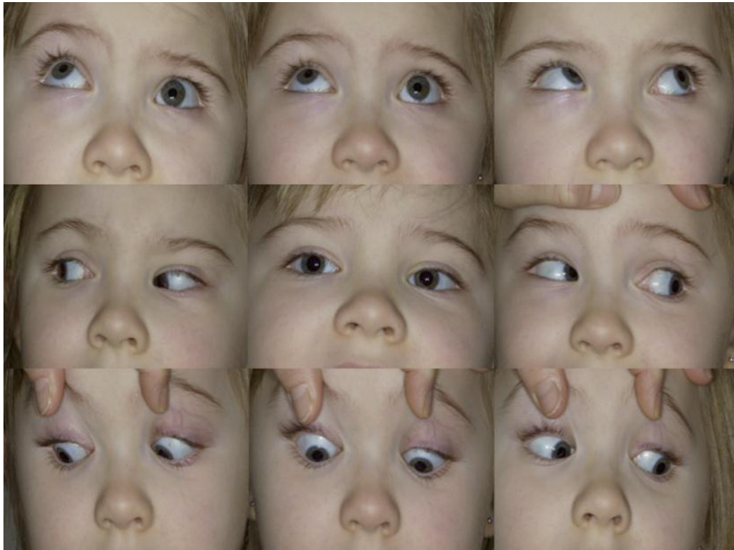
Fig. 1. Preoperative photo showing left head tilt (center photo) and right hypertropia.