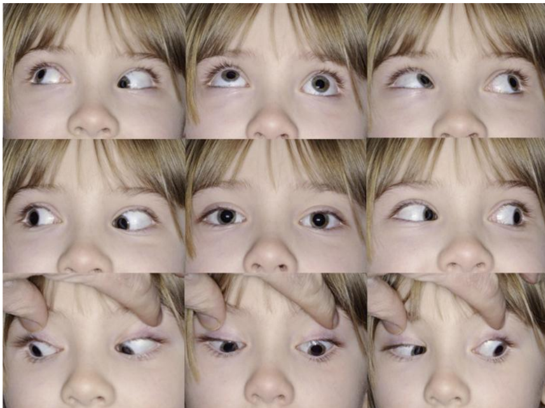
Fig. 4. Postoperative photo showing resolution of the head tilt in the primary position.