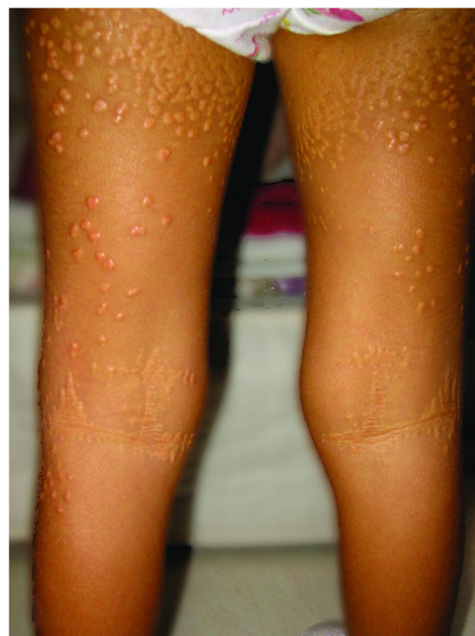
Figure 2 Xanthomas present on the extensor surface of the buttocks and thighs.

Ocular ultrasonographic examination in 20 children with ALGS found optic disk drusen in 90%. Retinal pigmentary changes are also common (32% in one study). 15 Although