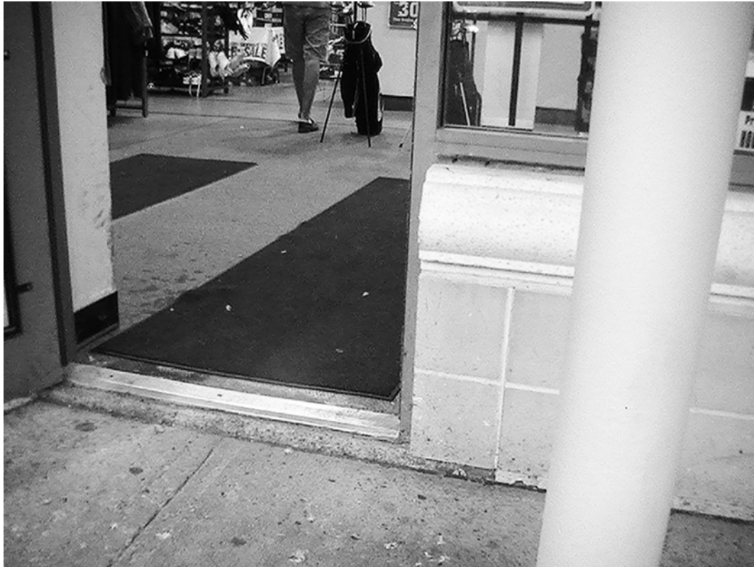
figure 2. Entrance to Sports Store