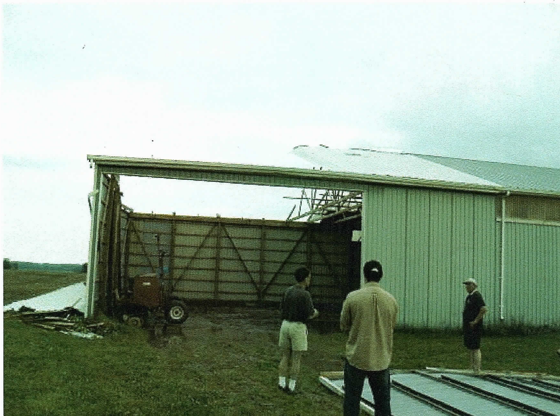
Storage Barn at 2669 Gladstone Drive