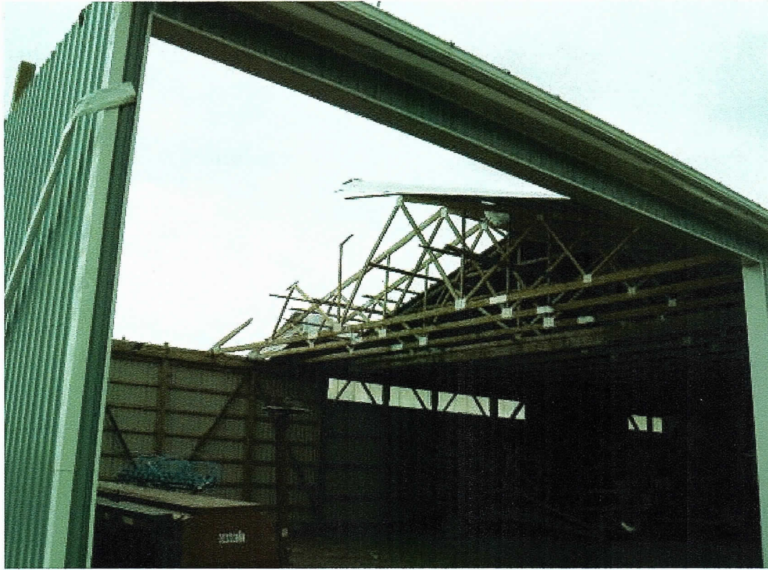
2669 Gladstone Drive