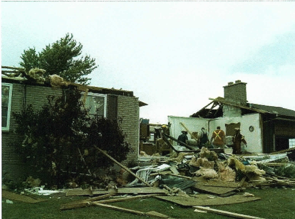
Bungalow at 51342 Wilson Line