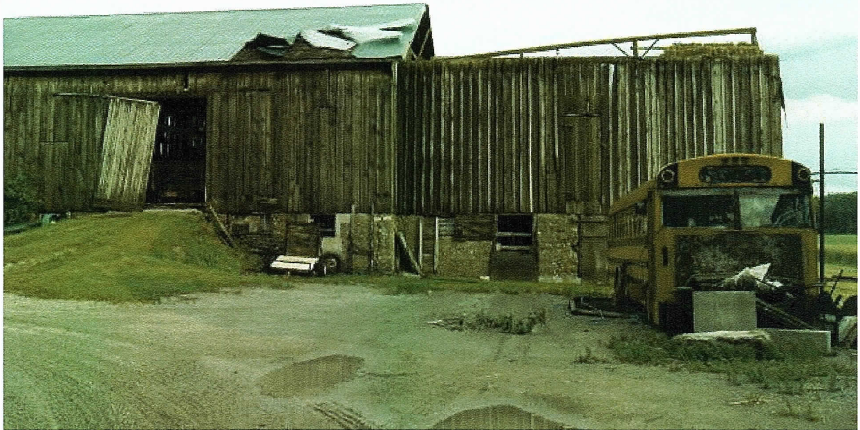
3279 Avon Drive