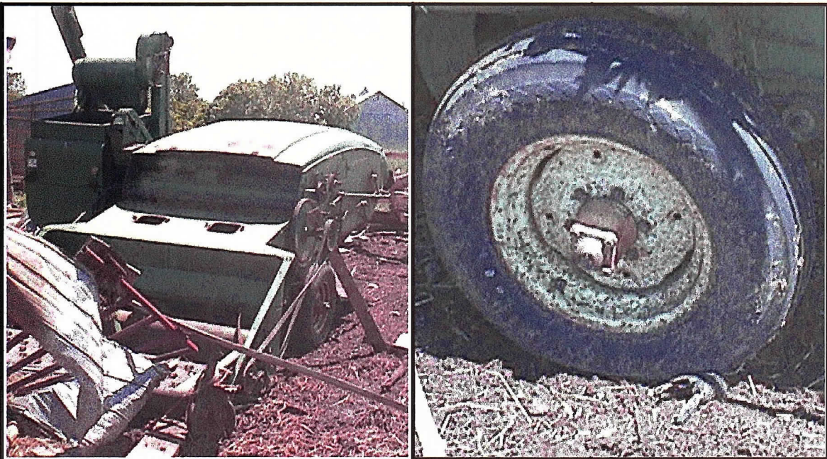
Combine and wheel with starling underneath