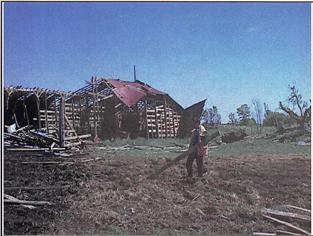
Facing SE (Dave)

Another interesting item was that a Niagara limestone rock, probably weighing more than 1 metric tonne, was moved to the NE along the ground for about 1 m.