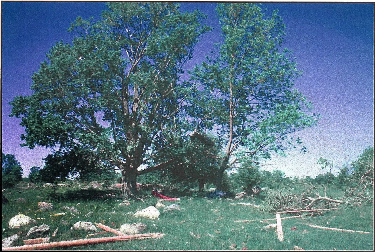
Debris to NNE of barn including metal roofing wrapped around tree limbs, facing NNE

However, as shown below, some debris was found to the NW of the site indicating a cyclonic motion associated with rotating tornadic winds. Also, a patch of long grass on the far right side of the picture was flattened from the N.