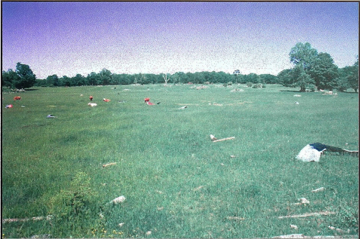
Debris and cows, facing E

Debris from the barn was found mostly to the ENE through NNE up to 500 m away.