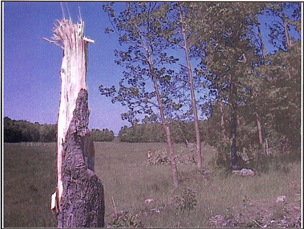
Facing NE, top of snapped tree near centre of picture

The owner of this property reported that the large maple tree below was thrown into another tree, spun around, then dragged about 20 m to the east. The deep, curved gouge in the ground in the forefront of the picture appears to support this.