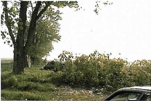
Facing W, tree laying NE