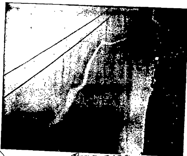
(1) Approx. 2120Z 14 Aug 95 Tornado Receding (After Touch Down) Long 99443/70797 looking NW