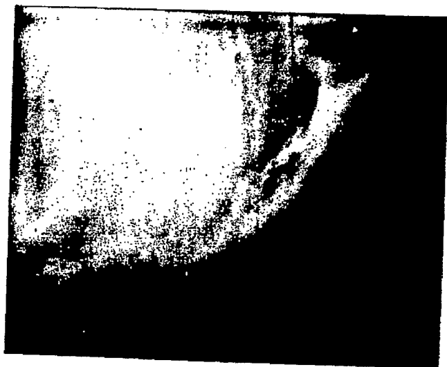
(M) (Funnel) Tornado Receding