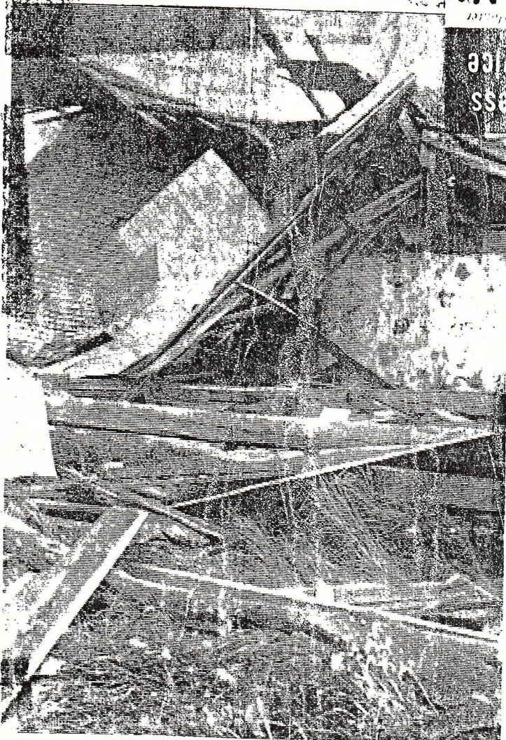
JOHN TEICHT'S BARN on Highway 10, two miles north-west of Dundalk, was wrecked in the sudden windstorm on the evening of June 11, 1968. The roof and timbers fell down on a combine, sitting high on the barn floor.