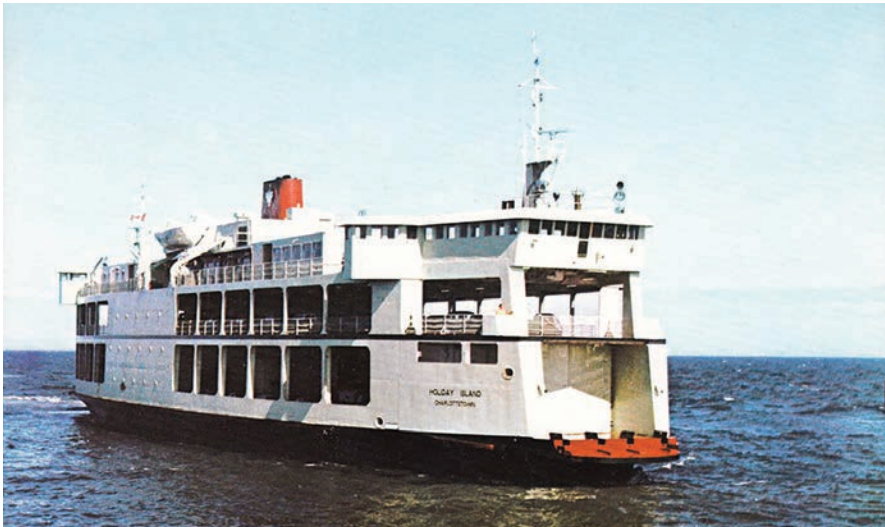
Figure 4: Beginning in 1962, “ro-ro”s – roll on, roll off ferries – were introduced for rapid loading and unloading. The names of the two so-called “hot dog” boats, Vacationland and Holiday Island (1971), reflected tourism’s dominance.

As a stopgap measure to relieve congestion, a second-hand ferry, re-named the L. M. Montgomery , was acquired in 1969. 76 In 1971, two more “ro-ro”—roll-on/roll-off—ferries were commissioned, the Holiday Island and the Vacationland . These three vessels’ names reflected their purpose: to handle summer tourist traffic (see Figure 4). Despite the augmented fleet, ferry arrangements only approached adequate when visitor numbers began to flatten out in the mid-1970s. Finally, the 250-car capacity of a massive new ferry (like its iconic predecessor, christened the Abegweit ), put an end to dolorously long ferry line-ups when it entered service in December 1982. 77 The escalating cost of replacing ferries helped direct Ottawa’s attention towards a different alternative for fulfilling its constitutional obligation to secure the rights of passage. That vision, in turn, cast the tourism merits of the crossing to Prince Edward Island in an entirely new light.