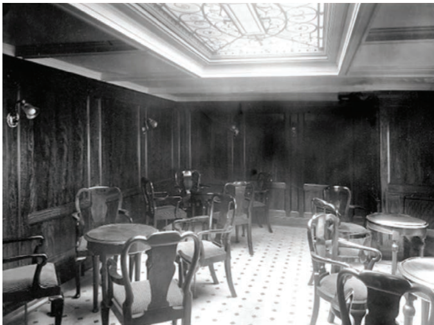
Figure 1: Smoking Room, S.S. Prince Edward Island . The vessel's elegant interior spaces suggested an ocean liner more than a ferry on a two-hour cruise.

round trips across the Strait. 22 The Mainland, it seemed, was finally within easy reach.