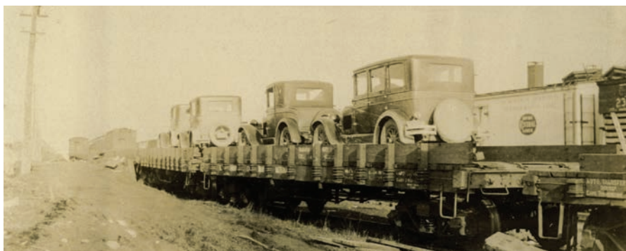
Figure 2: This detail from a 1920s postcard captures a major trend in Island tourism: the travel freedom provided by the automobile. However, until the S.S. Prince Edward Island was renovated to create an automobile deck, the only way for tourists to get an automobile to PEI was on a railway flatcar.