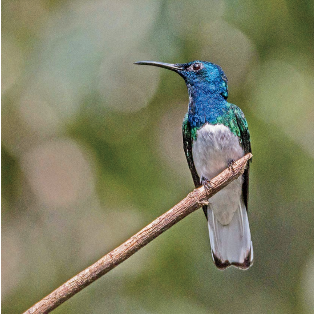
White-Necked Jacobin Hummingbird, Belize

Copyright © 2017 Massachusetts Medical Society.