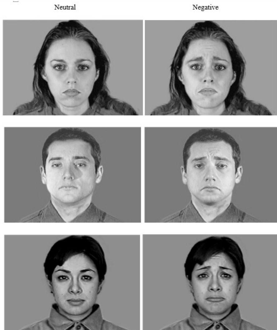
Figure 1. Example of facial stimuli used in the dot-probe task.

Stimuli selection was also an important consideration to ensure content-specificity. Dysphoric and neutral facial images were chosen based on previous empirical work (Gotlib et al., 2004a; Wells & Beevers, 2010). The facial stimuli used for this task consisted of 24 monochromatic, facial images (see Figure 1). Half of the images featured a Caucasian face and half a Hispanic face; in addition, half of the faces were female and half male. Each of the 12 models was depicted twice: once with a dysphoric expression and once with a neutral expression. These images were all adopted from the Montreal Set of Facial displays of Emotion (Beaupre & Hess, 2005).