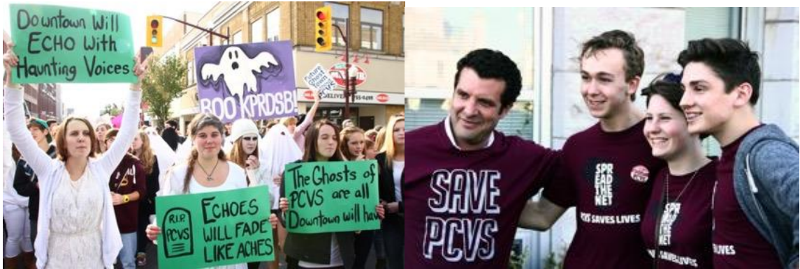
Figure 5. Raiders in Action's Hallowe'en protest. Figure 5. Rick Mercer with students after PCVS won the Spread the Net Challenge on March 20, 2012.