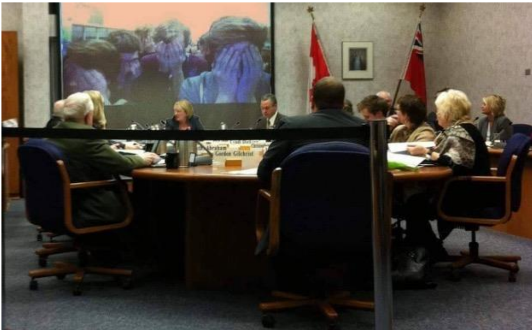
Figure 11. Raiders conquer the camera at KPR Board meeting, Feb. 23, 2012.