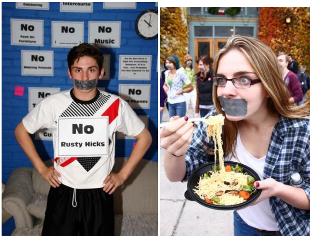
Figures 7-8. Day of Silence in support of teaching staff, Nov. 6, 2011. Photo on the right was exhibited in the Spark Photographic Festival, 2013.