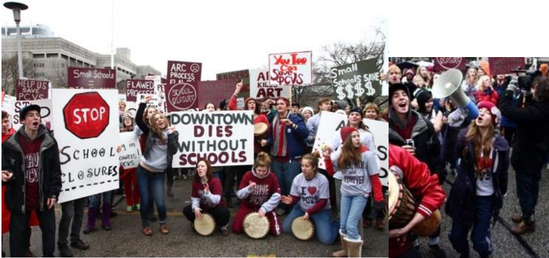
Figure – 9-10. Over three hundred call for stop to their school's closure at Queen's Park, Toronto, Dec. 5, 2011.