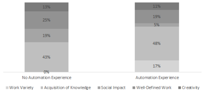
Figure 3. Importance of Factors for professionals with experience with test automation

Further, considering the experience with test automation, we observed that the general scenario is similar to participants that have worked or are working with techniques of automation, regarding the level of importance of each of the five factors. However, to those participants with no experience with automation, there is a considerable change in the value of these factors. This group of participants does not consider Work variety as an important factor, and they consider Social impact more important for their motivation than Creativity . This information is summarized in Figure 3.