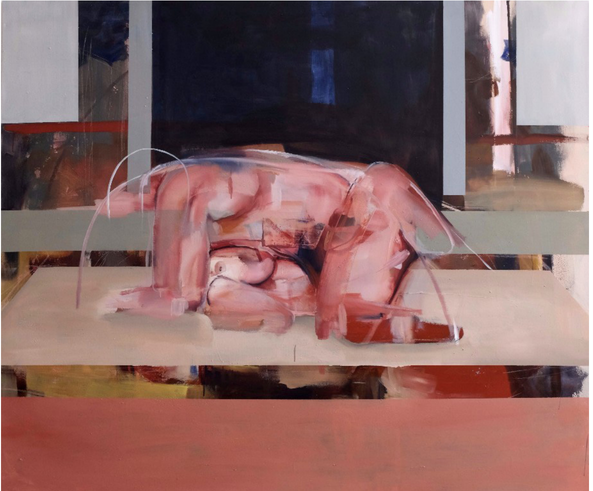
Angie Quick, Interior Landscape , 58x69 in., oil on canvas, 2017.