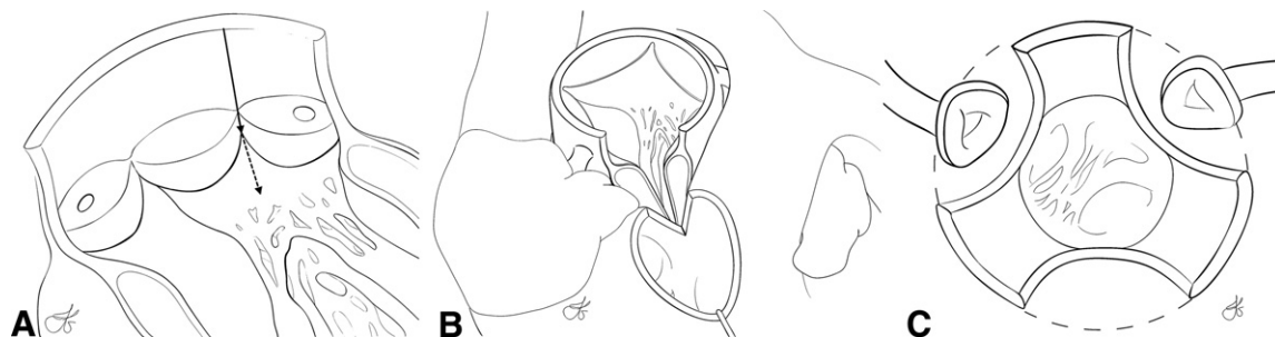
Figure 1. Schematic drawings of aortic root enlargement procedures. (A) Nicks and Manouagian procedures. We performed the Nicks procedure by enlarging the posterior aortic root toward the aortic annulus at the posterior commissure ( solid line ). We performed the Manouagian technique as an extension of the previous incision through the aortic annulus midway down the anterior leaflet of the aortic valve ( dashed line ). (B) Aortoventriculoplasty. The incision was carried through the wall of the right coronary sinus and into the muscular interventricular septum. The free wall of the right ventricle was also opened, exposing the interventricular septum from the anterior aspect. (C) Modified Bentall procedure. The sinuses of Valsalva were excised and the coronary buttons were prepared. The valved conduit was then implanted using a supra-annular technique.