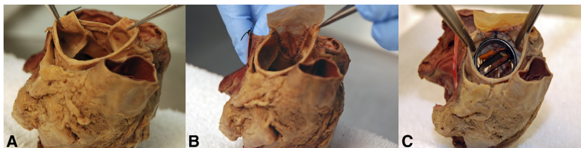
Figure 2. Photograph demonstrating the Manouagian technique. (A) The incision was made through the posterior commissure and carried halfway toward the free edge of the anterior leaflet of the mitral valve. (B) A pericardial patch was sewn into the root using a running continuous technique. (C) The mechanical prosthesis was implanted into the enlarged aortic root.

Optimal surgical management of the small aortic root remains controversial. ARE procedures are generally employed to address more significant PPM; however, there is certainly no