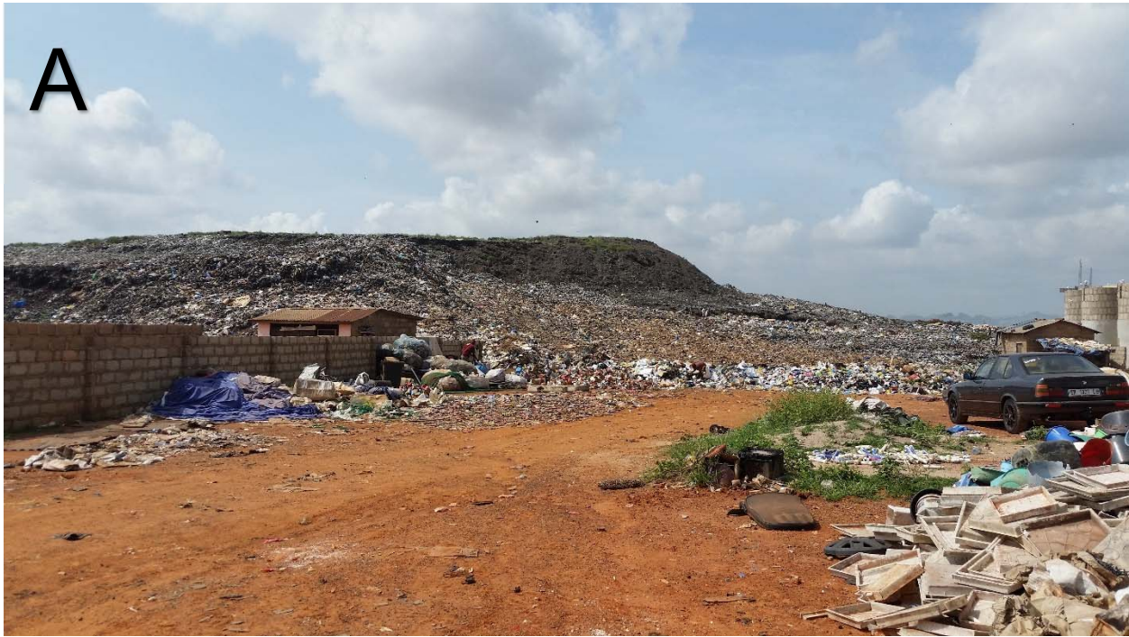
EXHIBIT 3 The Abokobi Open Dump