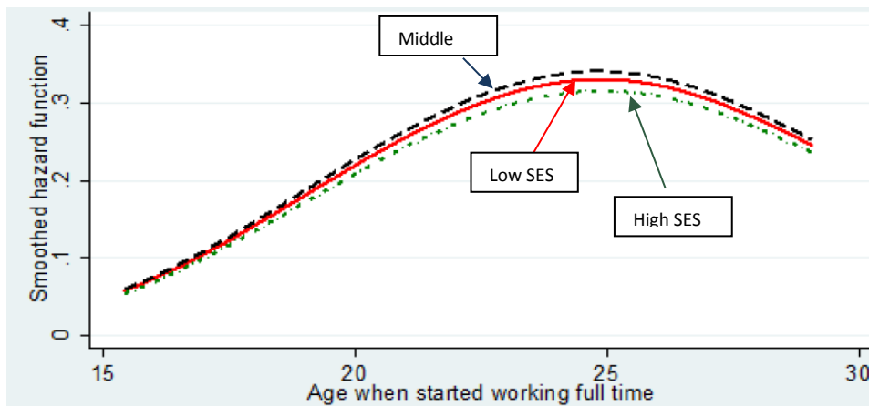
Chart 3: Weighted Cox Regression Smoothed Hazard Function by Parental SES for White Non-immigrant Canadian Males

The results of the Cox models allowed drawing the plots of the risk of entry into full-time work by age for the reference category, namely White, non-immigrant males. Chart 3 shows that the risk for this group of young people peaks at around their mid-20s; and that the risk of full-time work entry is highest for those in the middle SES, and lowest for those in the high SES. It is possible that those with high SES have more parental support and less need to work full-time, including a longer period of education. As for the lower risk of entry into full-time work for the low SES compared to that for middle SES, a possible interpretation is that those with lower SES have more difficulty obtaining full-time work.