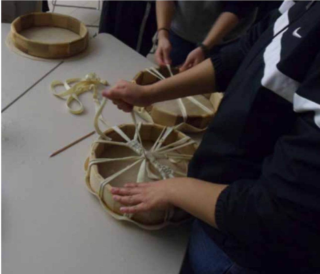
Figure 2. Students making hand drums at the cultural leadership camp.

This increased sense of belonging also increased student engagement beyond the programming. That is, the belonging that was nurtured in the programs provided a solid foundation and confidence for further success in the broader school context.