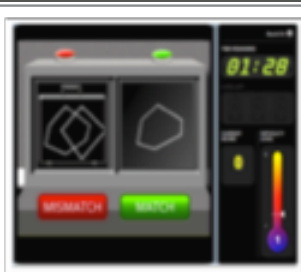
X Ray Machine