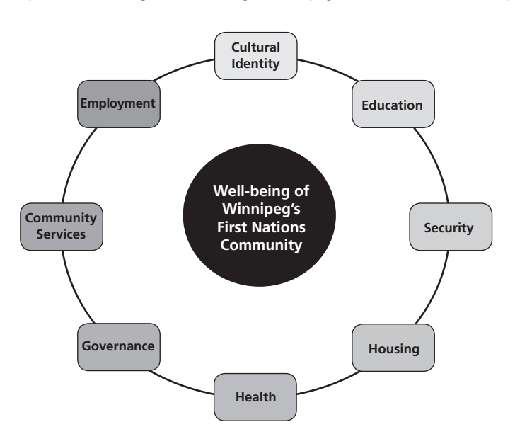
Figure 3.1: Key Issues Affecting the Well-Being of Winnipeg's First Nations Community

community to attend. The meeting was not as well attended as we would have hoped, highlighting the challenge of communicating with the urban First Nations community. The purpose of this meeting was to introduce the community to the project and its research team, and to answer questions. Asking those in attendance for their advice on how to attract more participants helped build our audiences at the later forums and strengthen our communications with the community.