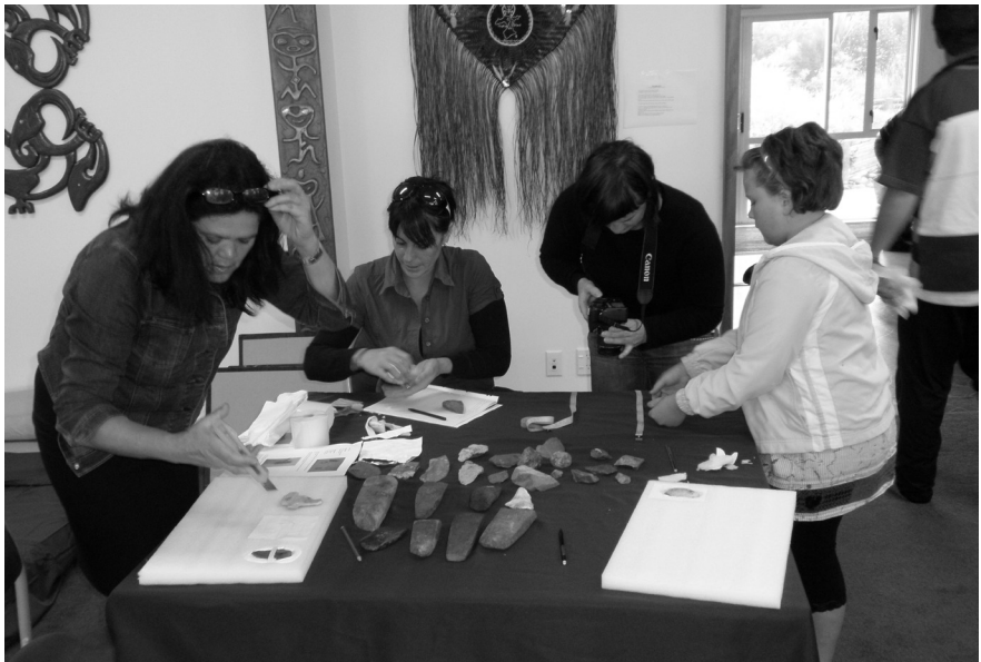
Fig. 4. On Rekohu (Chatham Islands, NZ) IPinCH Workshop attendees register taonga Moriiori (artefacts and treasured items) for a new exhibition inside Kopinga marae.